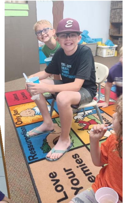
Kids enjoyed ice cream floats to celebrate the end of the school year and kick off summer!