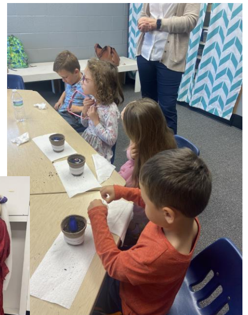
The ducks putting baby Moses in the bulrushes.