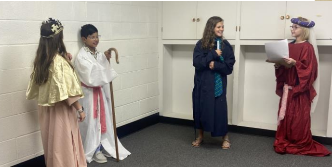
The lions interviewing Moses after the burning bush!