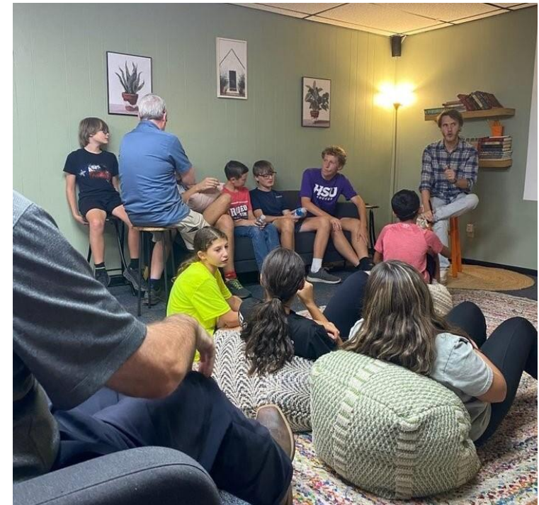
Youth students having discussion time during class on Wednesday night.

Please continue to pray for our students this fall!