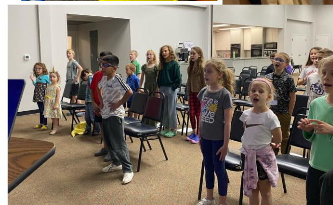
Sunday morning fun