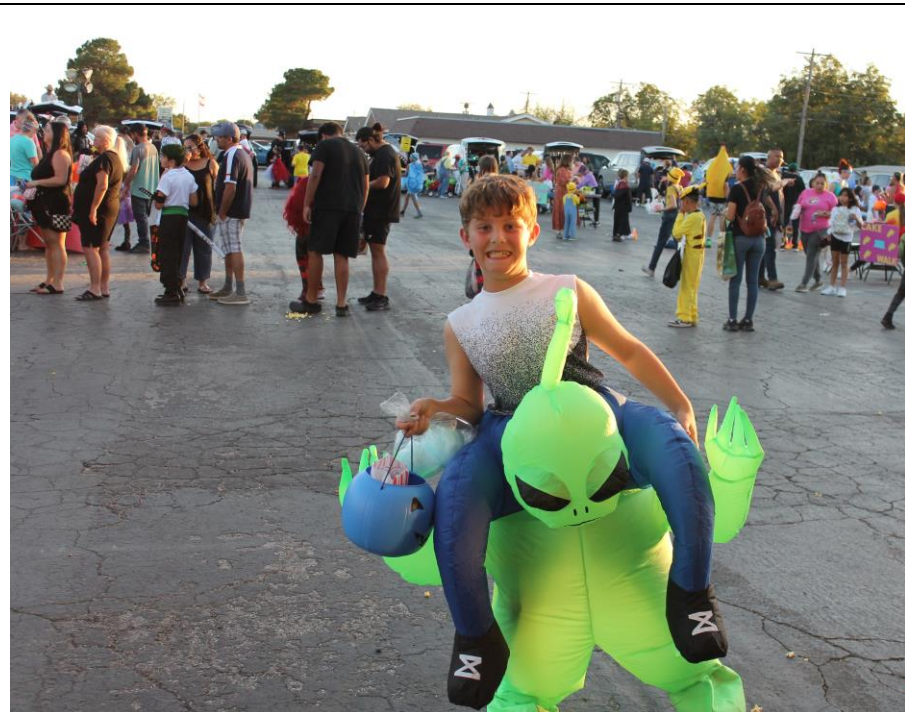
Thank you to everyone who helped make Trunk or Treat a success!