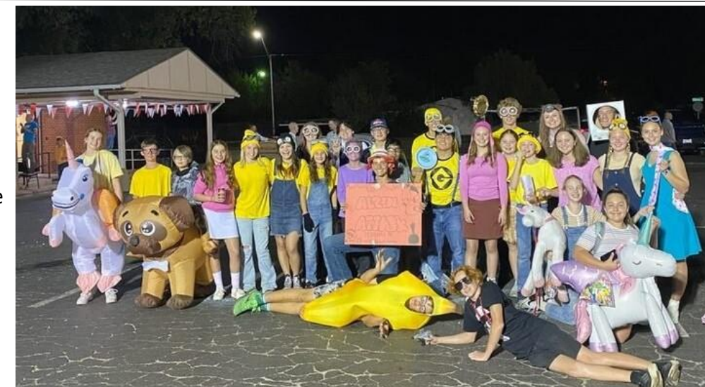
Thank you to our minions (and more) for volunteering your time to help with Trunk or Treat last Sunday!

Please continue to pray for our students this fall!