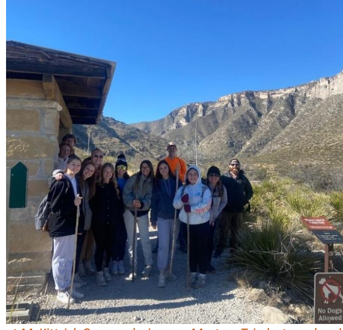
Hiking at McKittrick Canyon during our Mystery Trip last weekend! We had a great trip exploring New Mexico and West Texas!

Please pray for all our students this semester!