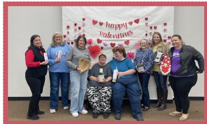
Ladies' Supper Bingo winners