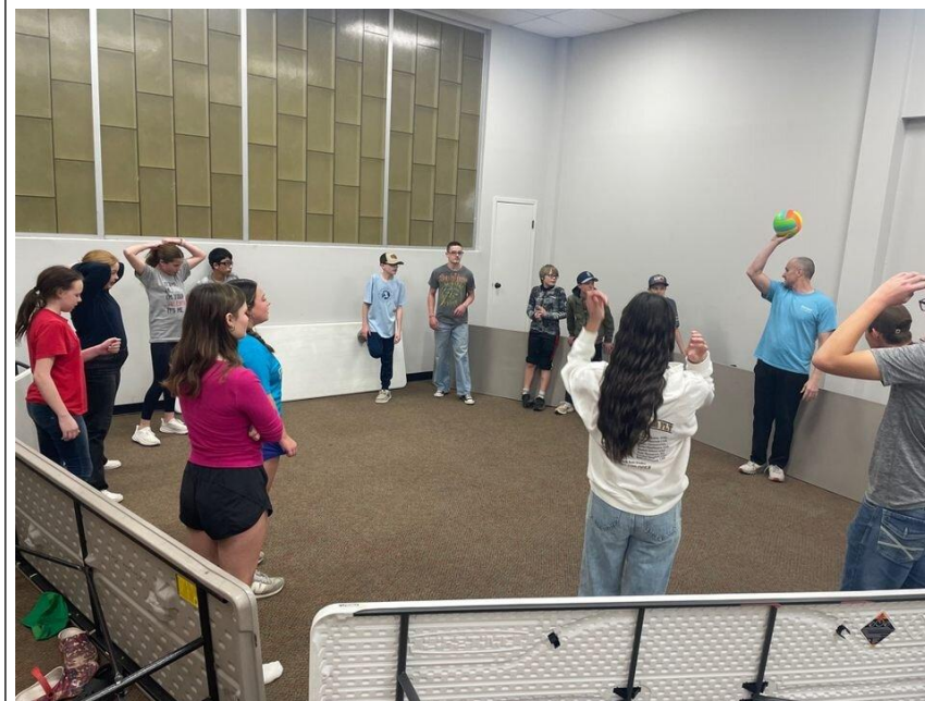
Youth students playing Gaga Ball at the Super Bowl party last Sunday!

Please pray for all our students this semester!