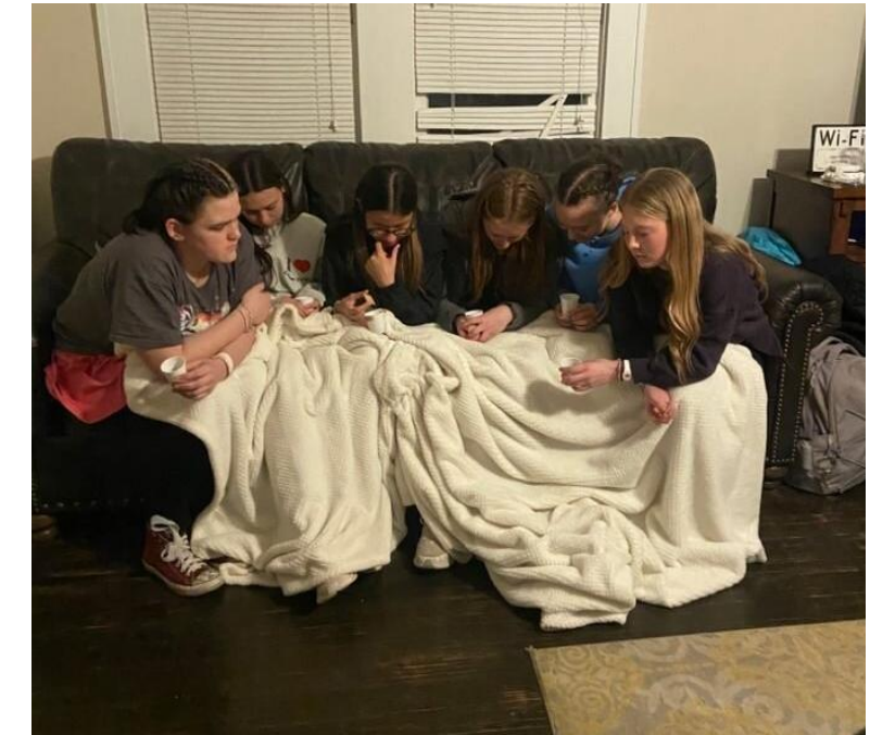
High School girls praying together on our Mystery Trip!

Please pray for all our students this semester!