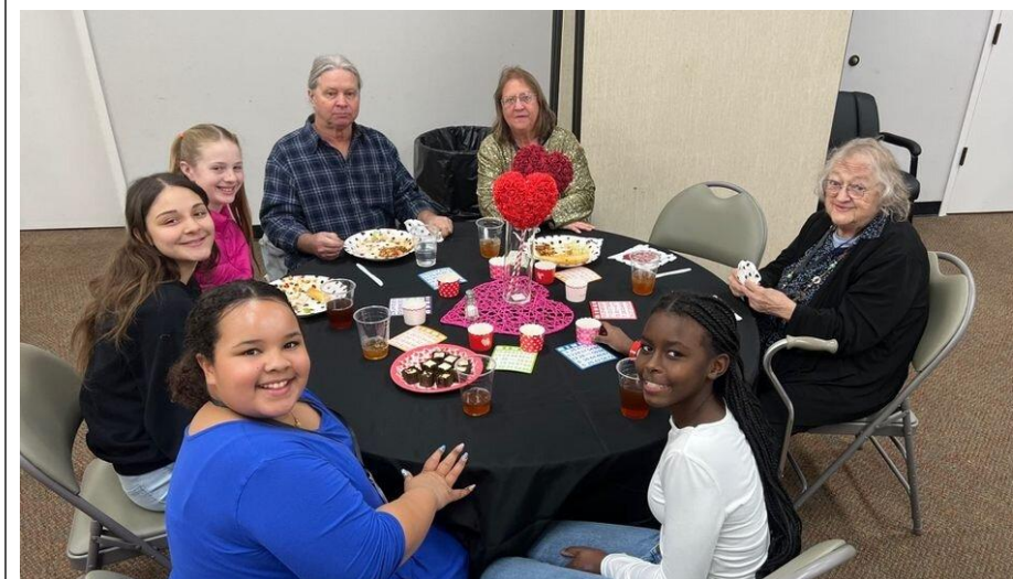
Thank you again to everyone who helped or participated in the Senior Valentine Luncheon!