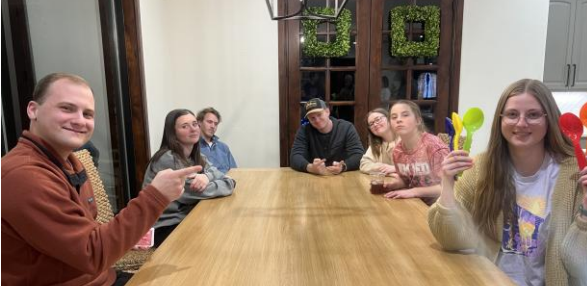
The 20-somethings' small group after a rousing game of spoons. Can you tell who won?